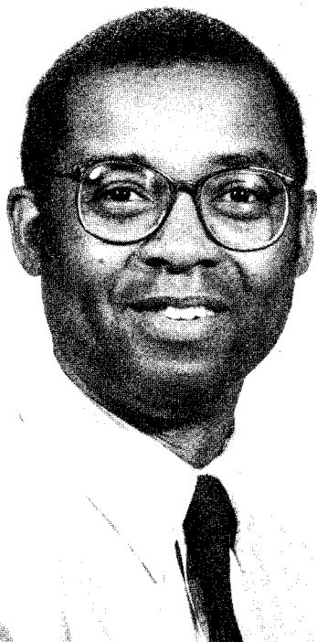
Notre Dame Photographic